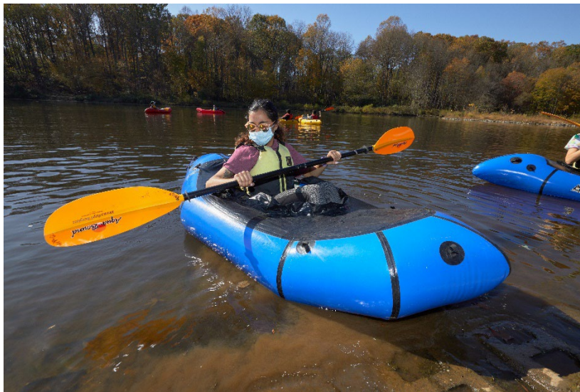
Mason Graduate Bike and Paddle.

If you need assistance to locate any additional resources, please do not hesitate to contact us. We also want to recognize and celebrate your participation in cultural events during your program. Please share with us any significant involvement or achievement. In the past, GMU J-1 students have been involved in student government, OIPS iCafes, GMU club sports, student research symposiums and campus award ceremonies to name a few.