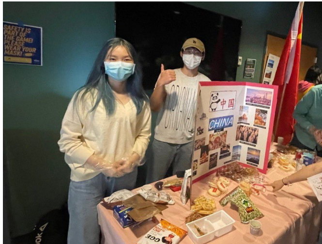
China 121 Students at iCafe.

The general rules regarding applicability of the individual mandate of the ACA and availability of ACA-compliant coverage also apply to J nonimmigrants, but that the minimum levels and types of coverage are still required as a condition of J-1 or J-2 status, even if those nonimmigrants are additionally subject to the ACA's individual mandate. For more information please visit: https://shs.gmu.edu/insurance/resources/