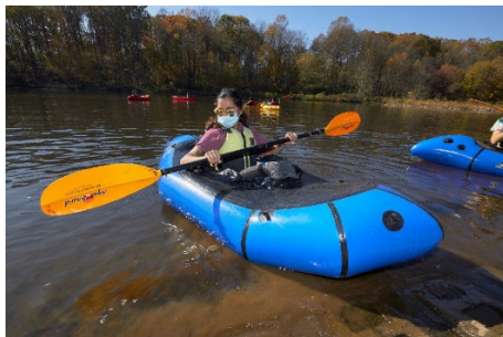
Mason Graduate Bike and Paddle.

If you need assistance to locate any additional resources, please do not hesitate to contact us. We also want to recognize and celebrate your participation in cultural events during your program. Please share with us any significant involvement or achievement. In the past, GMU J-1 students have been involved in student government, OIPS iCafes, GMU club sports, student research symposiums and campus award ceremonies to name a few.